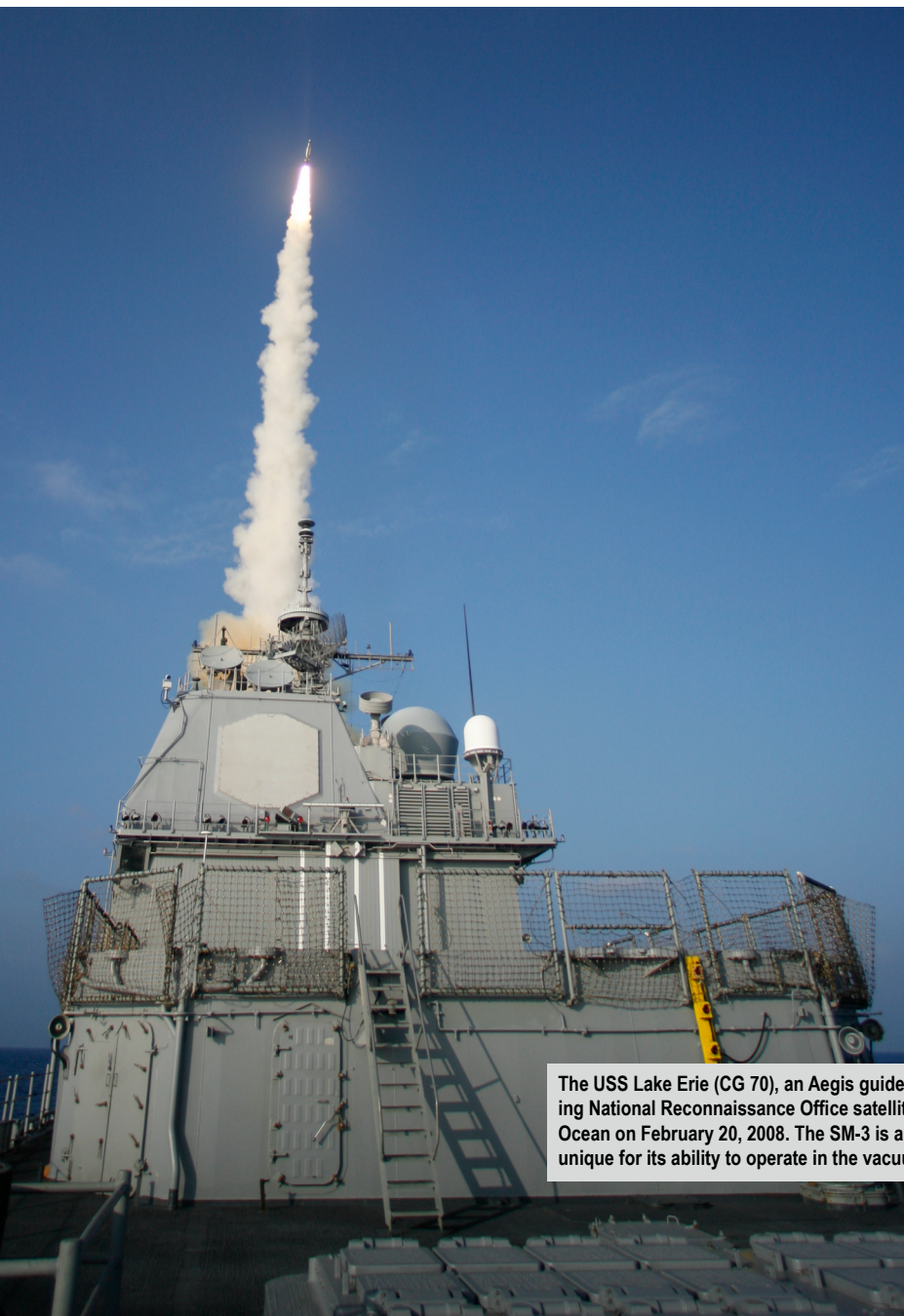
The USS Lake Erie (CG 70), an Aegis guided missile cruiser, launches a Standard Missile-3 (SM-3) at a non-functioning National Reconnaissance Office satellite as it travels through space at more than 17,000 mph over the Pacific Ocean on February 20, 2008. The SM-3 is a component of the U.S. Navy's Aegis Ballistic Missile Defense System, unique for its ability to operate in the vacuum of space.

Just as large-scale combat and multidomain operations are joint endeavors, missile defense is a joint fight. For example, the U.S. Air Force provides defensive counter-air capabilities through its Red Sea fighter patrols and relies on media reporting from counter-Houthi operations to confirm successful shoot-downs of enemy unmanned aerial vehicles. The U.S. Navy operates the Aegis Combat System, 2 a network of radars and interceptors carried aboard ships. Our allies and partner nations have similar systems and use their own terminology and tactics. To successfully integrate, intelligence professionals must learn a new language of joint shorthand and brevity terms unique to the air defense community. Likewise, the ability to communicate with the operators of our sister services’ defensive capabilities in their own language pays dividends and shortens response times. Just as the Army maintains doctrinal terminology for unified land operations, the Navy and Air Force do the same for their domains. If we play in other services’ sandboxes, being “bilingual” is an asset.