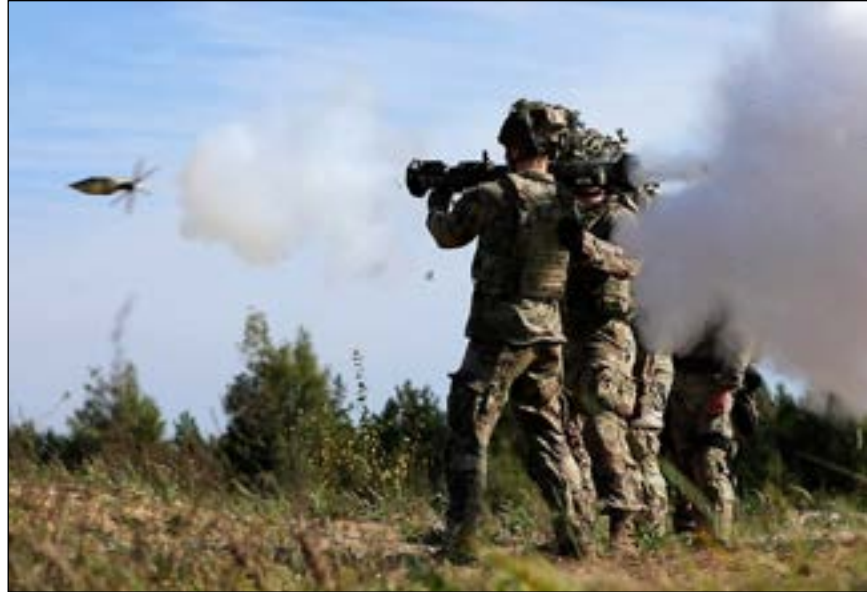
Soldiers with 1st Battalion, 506th Infantry Regiment conduct AT4 live-fire training in Adazi, Latvia, on 17 September 2023.

battle damage assessment reporting requirement is crucial (when observation is possible) because it reinforces the purpose of the platoon's mission — suppression of Objective Blue Linx in support of their sister platoon.