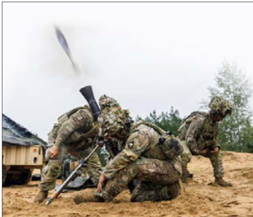
Mortarmen in 1st Battalion, 506th Infantry Regiment “Red Currahee,” 1st Infantry Brigade Combat Team, 101st Airborne Division (Air Assault), fire an 81mm mortar system during a fire support coordination exercise at Camp Adazi, Latvia, on 26 August 2023.

After completing Joint Readiness Training Center (JRTC) Rotation 22-10, the 1st Battalion, 506th Infantry Regiment, 1st Brigade Combat Team, 101st Airborne Division (Air Assault), identified digital fires capabilities as a gap in our training progression and fires enterprise. Our battalion’s training glidepath after JRTC already included a machine-gun (MG) academy concept to validate tactics, techniques, and procedures (TTPs); standard operating procedures (SOPs); and crew drills across the formation and build proficiency within weapon squads. We chose to incorporate weapons squads into the digital FSCX to maximize training at echelon and focus on transitions from indirect to direct fire. Including these squads also provided