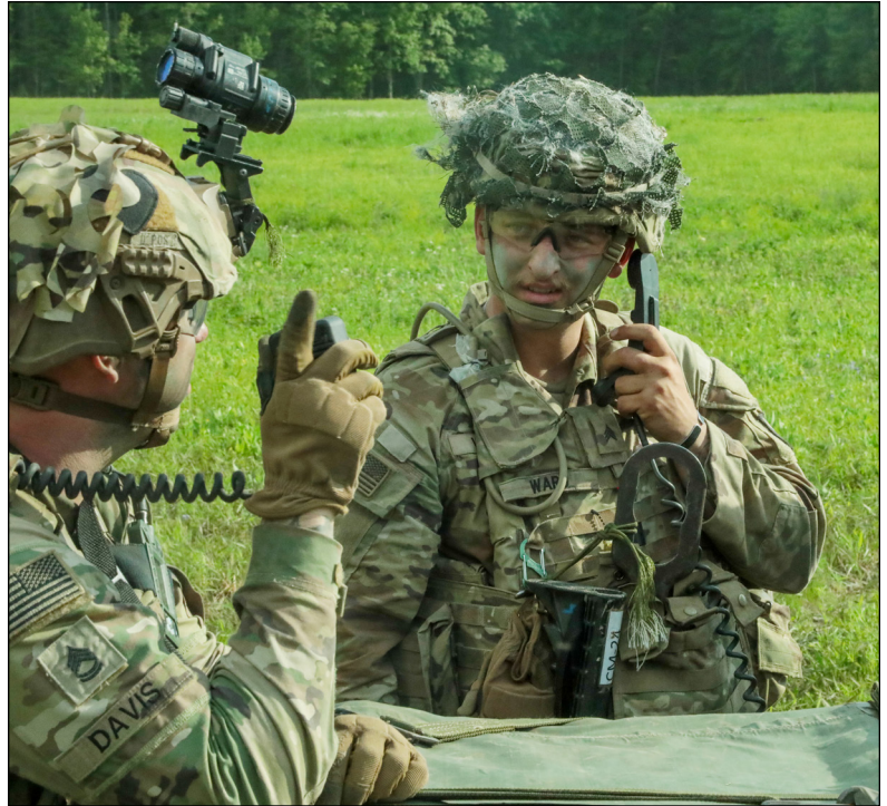
A Soldier with 1st Battalion 320th Field Artillery Regiment conducts a radio check in preparation for a gun raid during Operation Lethal Eagle 24.1 on 29 April 2024 at Fort Campbell, KY.

Radio planning begins with RAP-TR. This system serves as the cornerstone for creating, manipulating, and distributing radio plans across formations. Within the RAP-TR system, the radio planning application Atom takes center stage; it