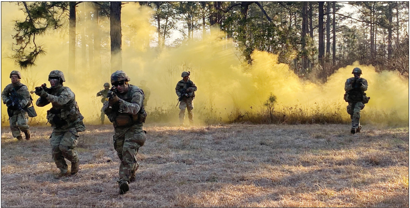
Students assault an objective during Leader Forge, their culminating exercise in IBOLC. Infantry lieutenants come to IBOLC eager to learn, and it is remarkable how much they improve during their 19 weeks in the course.

must provide exemplars who embody this ideal. Our students learn more from the examples of their instructors than they do from the instruction they receive in our course. There is no substitute for the modeling provided by our platoon trainers.