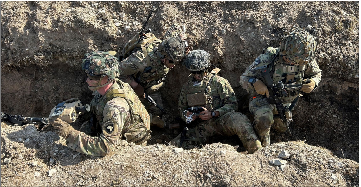
Platoon headquarters elements consisting of a platoon-level leader, radio-telephone operator, forward observer, and unmanned aerial system operator work together to command and control the platoon.