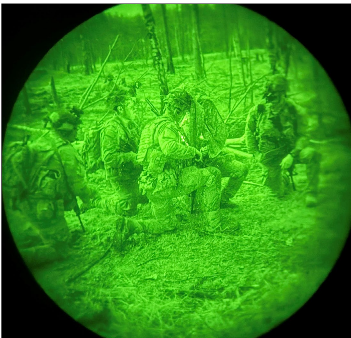
Soldiers in 2-506 IN employ a drone in a crew manner at night.