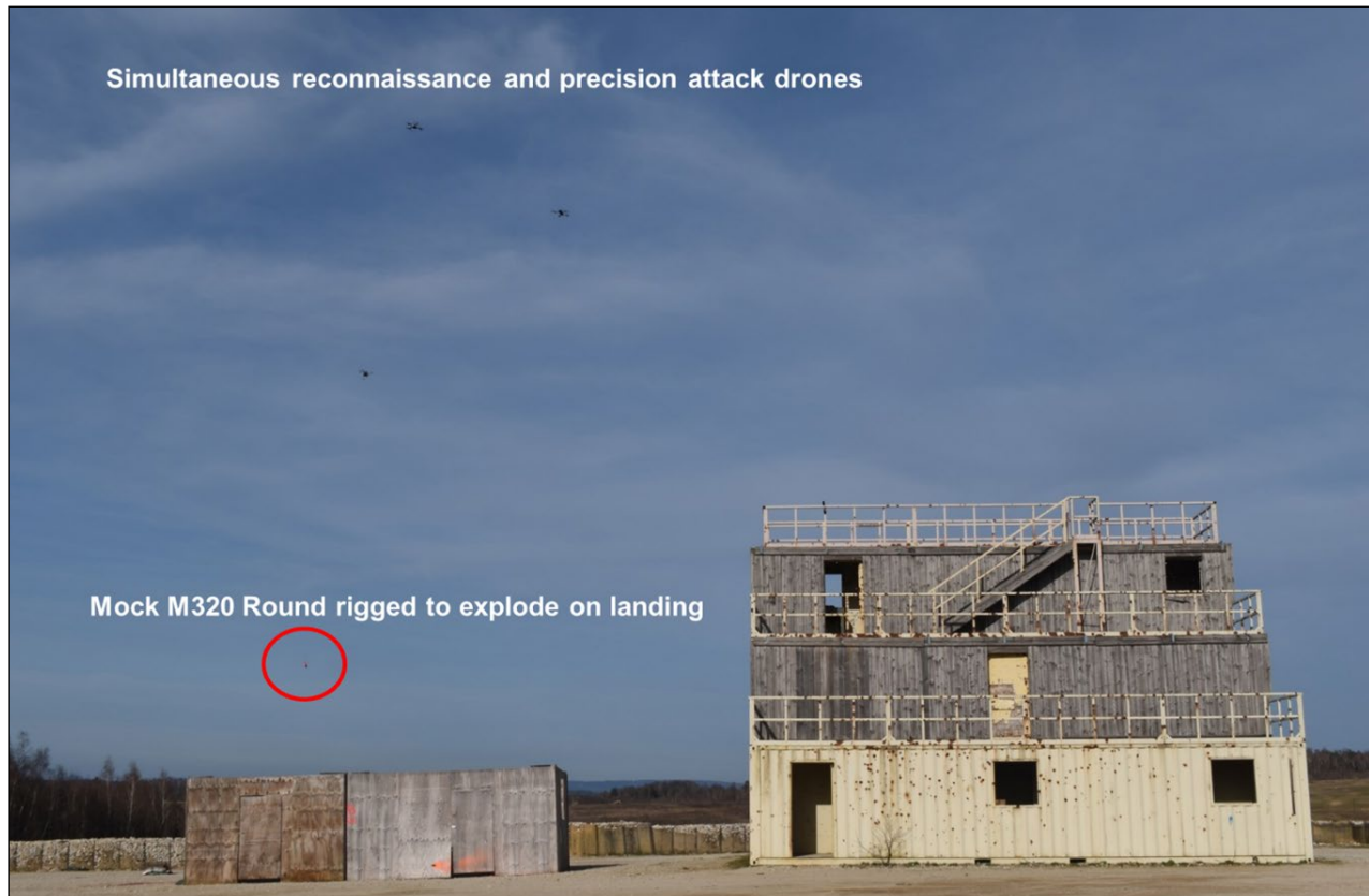
Figure 2 — Example Exercise with COTS Drones Employing Reconnaissance and Precision Attack Capabilities

Just as we needed a shared vision for employment by leaders, the same was true for our operators. Creating plain speak — jargon and acronym free — training objectives and rules for our Soldiers provided them a knowable training path (see Figure 3). For example, placing the drone into operation, developing a simple flight path, and using identifiable terrain features to quickly deconflict air space with other drones gave tangible actions for our operators. This also helped