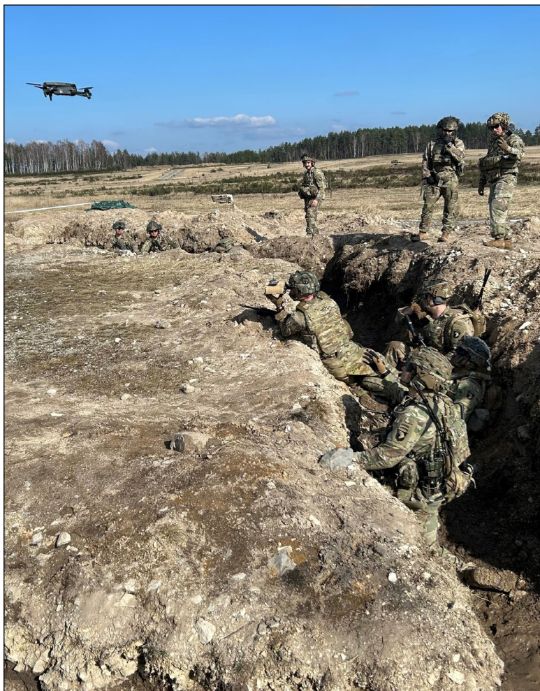
COTS drones, although easier to use than the Raven or Puma, require expert operators to rapidly employ in tactical situations.

Systematizing an activity helps to weight the effort appropriately. We found adding drone employment to our battalion training resource meeting made an outsized impact. When our drones were just another system sitting in a tough box dependent on the individualized efforts of the high-speed operator or innovative leader, we had sporadic successful employment. Once we added the issuing of UAS and requesting of a ROZ as critical items for each training event — the same as ammunition and land — we were able to increase training opportunities. Events that were not