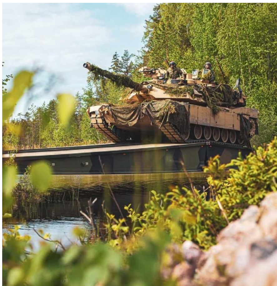
Figure 4. A tank from Assault Company, 1 st Battalion, 8 th Cavalry Regiment conducts a wet gap crossing during Operation Lock, May 2023.

A three-person crew on the NGMBT changes this progression become a new Soldier would move immediately to the driver's position and their actions can mean the difference between life and death of a crew. Training management and crew stability becomes even more important when the NGMBT is operated by three crew members. Retaining crew integrity, to include the driver, results in even