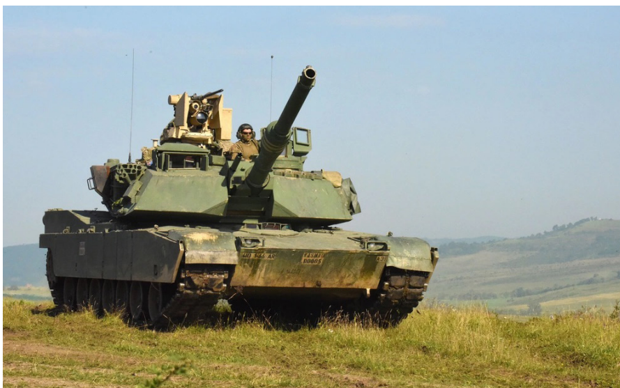
Figure 2. U.S. Army Soldiers of 1 st Battalion, 66 th Armored Regiment, 3 rd Armored Brigade Combat Team, 4 th Infantry Division, setup their M1 Abram Tanks during Saber Getica 17 in Romania, July 10, 2017.

I believe that another organization change will occur with the NGMBT, and there is potential to transition back to five tanks per tank platoon affecting the tactical-level echelons across the U.S. Army. Note that this assessment comes without the knowledge of the cost estimate of what the NGMBT will be compared to the M1 Abrams cost. Referencing the FY23