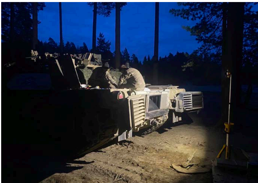
Figure 3. Mechanics from Assault Company, 1 st Battalion, 8 th Cavalry Regiment's field maintenance team conduct battle damage assessment repair on an M1A2 SEPv3 Abrams tank during Operation Lock, May 2023.

The last DOTMLPF factor considered in this article is training. The current tank crew member's training progression begins at the loader position, then the crew member progresses to the driver