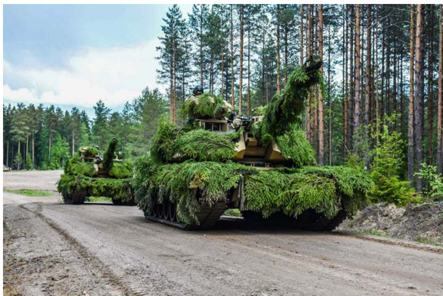
Figure 1. Tanks from Assault Company, 1 st Battalion, 8 th Cavalry Regiment conduct a Combined Arms Breach Full Dress Rehearsal at Vekaranjarvi, Finland prior to Operation Lock 2023.

Maintenance is what gets a tank company into the fight and the reduction of one crew member extends the amount of time it takes to maintain