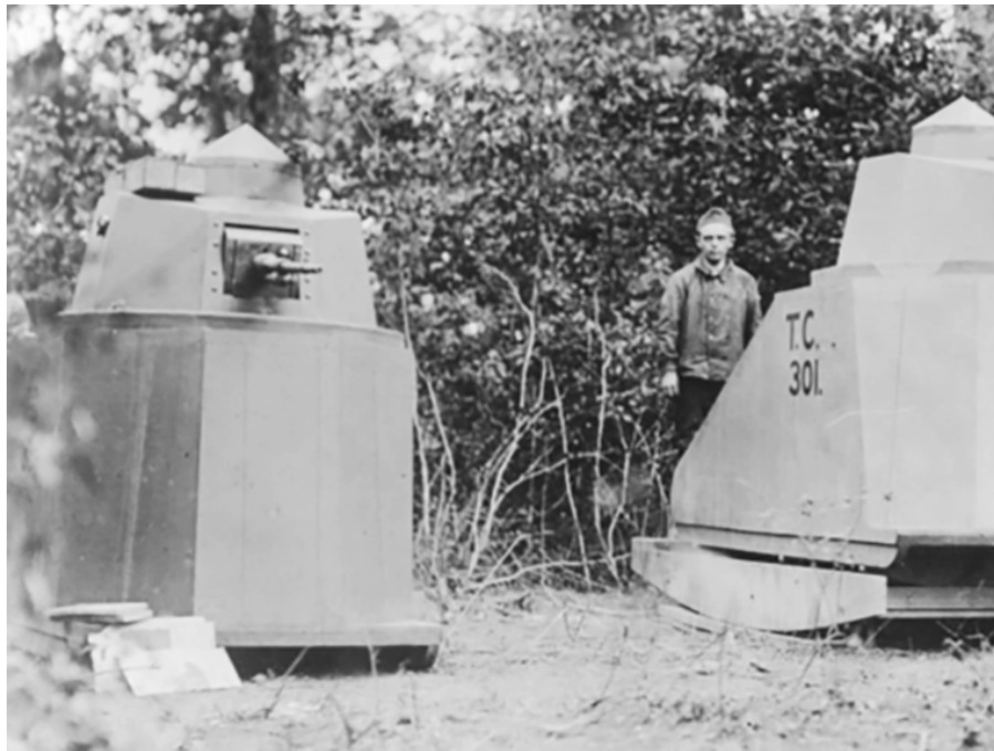
Figure 1. U.S. Tank Corps tank gunnery training devices of World War I.

In World War I the creation of the first American tank force triggered generation of the Army's first tank gunnery training program. Its focus lay upon weapons operation and maintenance. 2 For crews reliant upon vision slits for situational awareness, subject to sudden vehicle breakdowns, and working in the confines of a steel beast that quickly filled with fumes, simply firing the weapon in the general direction of the enemy proved an accomplishment, particularly in those tanks in which the gunner also served as the loader and tank commander. In the 1920s tank gunnery training retained its focus upon the gunner's ability to operate and maintain his weapon, refined through the addition of checks on sight usage and target sensing. Live fire engagements constituted the culmination of this training, with a report card