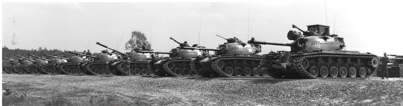
Figure 4. M48s on a gunnery range in Germany, 1959.

Over time and under the pressure of combat gunnery improved — and not just in the war zone. Increases in military funding and end strength enabled more realistic manning and equipping of armored units that in turn facilitated training to existing standards and doctrine. This upward trend continued throughout the 1950s, benefiting from combat experience and the lingering danger of an actual shooting war with the Soviet Union. Indeed, units began to transcend established doctrinal training measures, exemplified by the 1 st Armored Division's creation of a special battle course to test crew and gunnery skills. 11 Tank gunnery proficiency also benefited from the attention given to crew, section, and platoon operations that included the regular use of crew proficiency tests, battle drills, and live fire battle runs in which tank platoons engaged targets from offensive and defensive postures. 12 The decade also marked improvements in the tools available to tank gunners. The emergence of a fire control system that linked the main armament, coincidence or stereoscopic rangefinder, and a mechanical