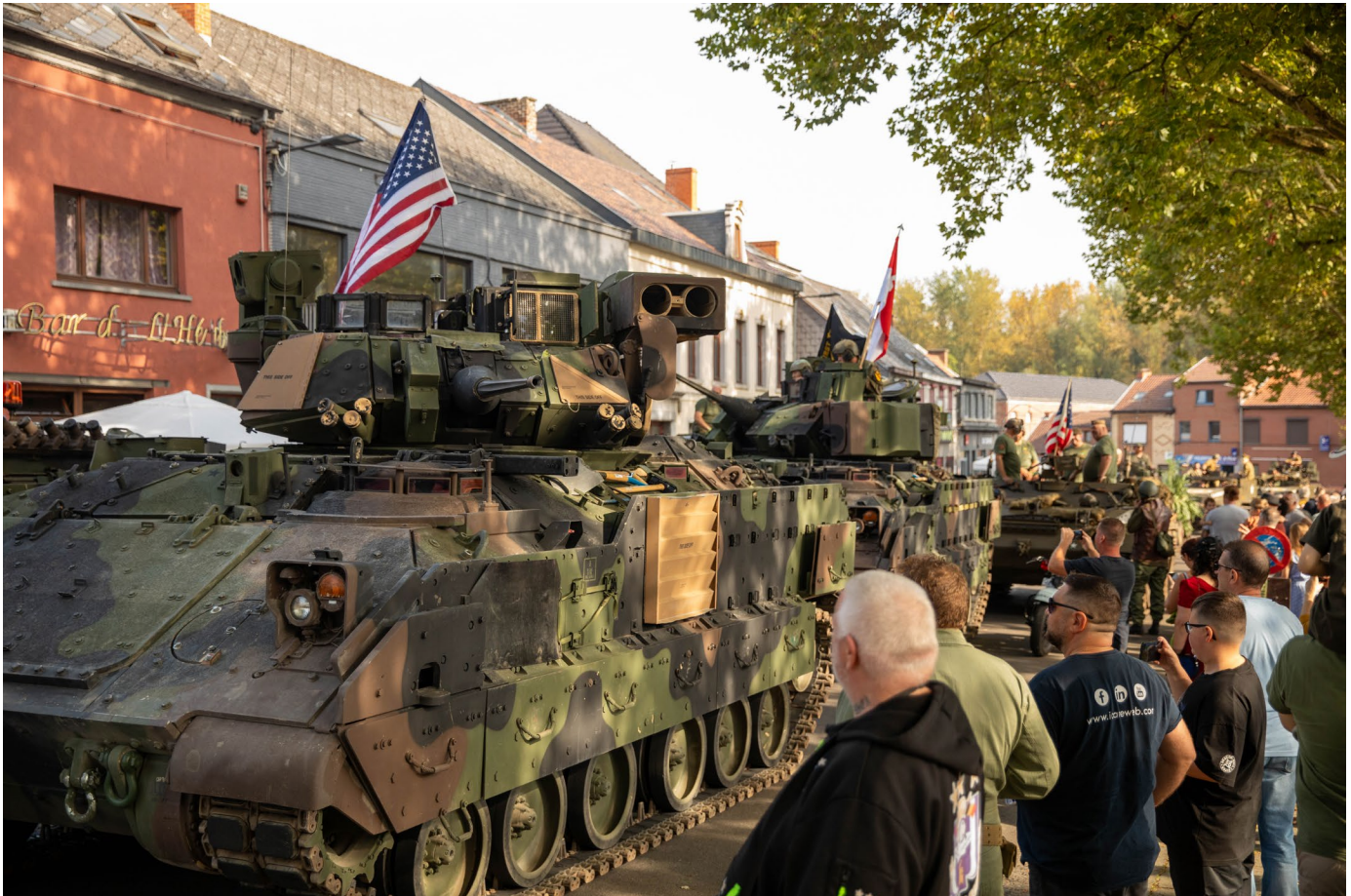
MONS, BELGIUM (Sept. 1, 2024) – Locals interact with U.S. Army Soldiers and an M2A3 Bradley Infantry Fighting Vehicle from 2nd Battalion, 5th Cavalry Regiment, 1st Armored Brigade Combat Team, 1st Cavalry Division, during the Tanks in Town commemoration event in Mons, Belgium, Sept. 1, 2024. V Corps regularly provides personnel and equipment to support community events in various countries across Europe.