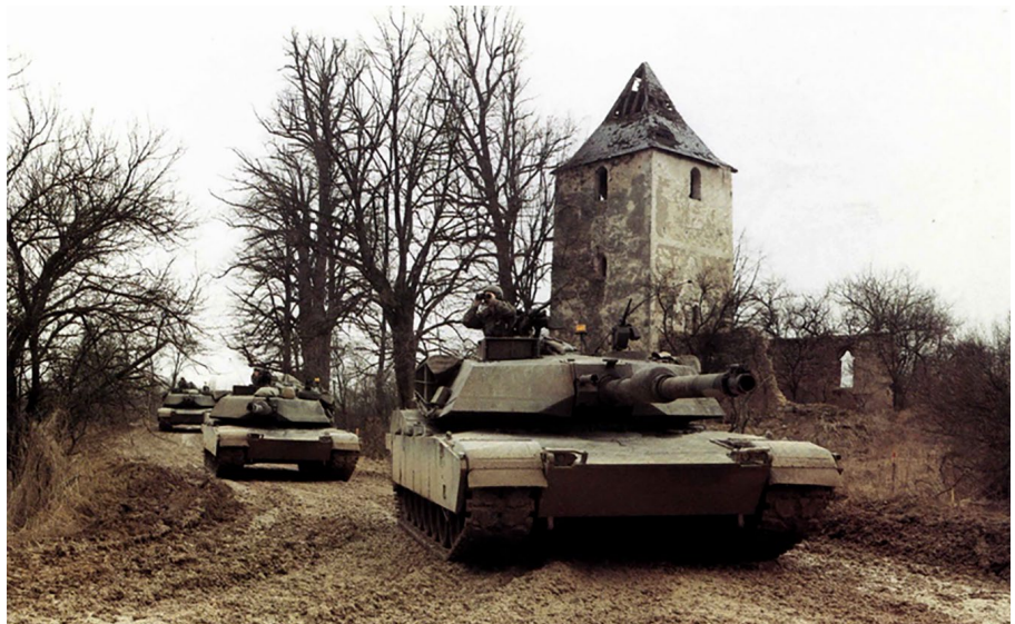
Figure 7. A tank platoon from 3 rd Battalion, 64 th Armor Regiment at Hohenfels, Germany.

Tank gunnery standards remained high, and doctrine continued to evolve, incorporating lessons learned from Desert Storm. Moreover, the 1990s marked the emergence of the M1A2,