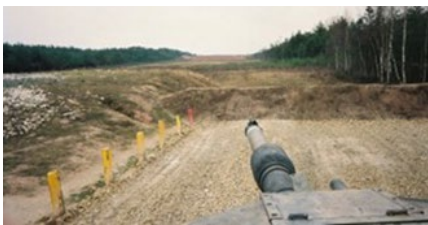
Figure 6. Tank from 2-64 Armor on Grafenwoehr’s Range 109.

In 1973 the newly created Training and Doctrine Command sought to transform Army training through emphasis upon raising combat readiness in preparation for a near-term large-scale conflict. The Arab - Israeli conflict of the same year spurred these efforts by demonstrating the cost of unpreparedness. Efforts to improve tank gunnery thus began within TRADOC’s broader, Army-wide training reform. Lessons learned from the Middle East war were disseminated to tank units via training circulars, and the Armor Center developed a proficiency test for tank crew members. 20 Implementation of the tank master gunner program in 1975 generated subject matter experts to assist unit commanders with training, weapon operation and maintenance, and the correction of gunnery problems. 21 Tank gunnery doctrine also marked a renewed emphasis upon unit lethality with the introduction of a platoon gunnery table. Encouraged by the TRADOC’s readiness emphasis, units undertook their own training initiatives, introducing timed engagements and long-range precision engagements while highlighting the import of first round hits and ammunition