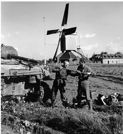
Figure 3. A tank crew cleaning their tank's main gun after operations in Belgium, September 1944.

In 1940 the creation of the Armored Force in response to wartime developments in Europe marked a major expansion of the Army's tank component, resulting in the first armored divisions and separate tank battalions. The scale and pace of this expansion undermined tank gunnery proficiency. The emphasis given to training new personnel, organizing new units, and building cadres for the next wave of unit activations diluted the existing talent and eroded overall gunnery knowledge and skills. The first armored divisions and separate tank battalions therefore developed their own training programs, which included gunnery techniques. Reports on their activities were shared with the Armored Force headquarters, which in turn strove to incorporate best practices into its own training efforts. Nevertheless, the absence of a standard gunnery training program made unit and formation commanders the architects and evaluators of their own training. Hence early Armored Force gunnery instruction reflected a broad range of approaches shaped by materiel availability, range access, and unit commander experience. Moreover, commanders who considered maneuver more important to combat effectiveness than gunnery