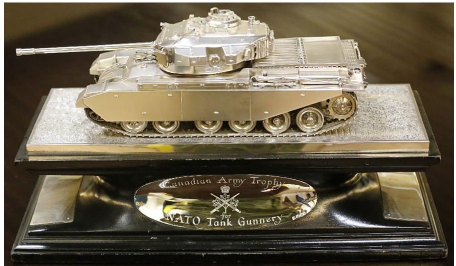
Figure 5. The Canadian Army Trophy.

Managing personnel turbulence within units proved difficult when many experienced Armor NCOs either left the Army or branch transferred in the wake of the Vietnam War. Their loss was offset by the transfer and reclassification of NCOs from other branches who, despite their responsibility for training junior enlisted Armor crewmen, received no familiarization training before their assignment to tank units. The Armor School trained NCOs in necessary leadership skills but not the related technical competency. This was either learned on the job or through improvised unit schools. 14 Hence new NCO tank commanders proved limited in their ability to supervise their crew members or fully utilize the capabilities of their tank. These problems were aggravated by the assignment of non-Armor command sergeant majors and first sergeants to tank units, where their lack of technical and tactical