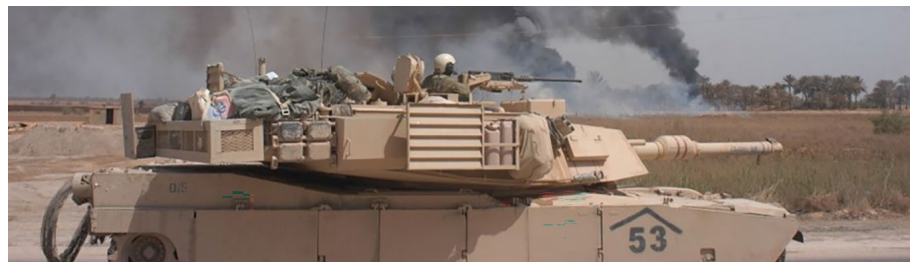
Figure 9. An M1A1 of the 3 rd Infantry Division during Operation Iraqi Freedom I. The extended bustle rack was fabricated before the invasion began when it became clear that division combat units would need more supplies than their trains could accommodate.