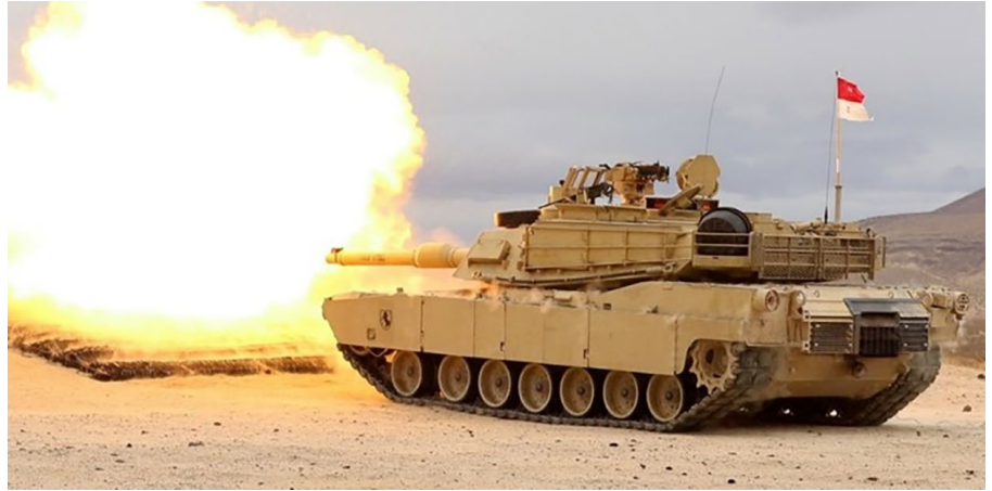
Figure 12. An M1A2 Abrams SEP V2 main battle tank of the 11 th Armored Cavalry Regiment fires a M865 training round at the National Training Center and Fort Irwin training area, Dec. 9, 2021.