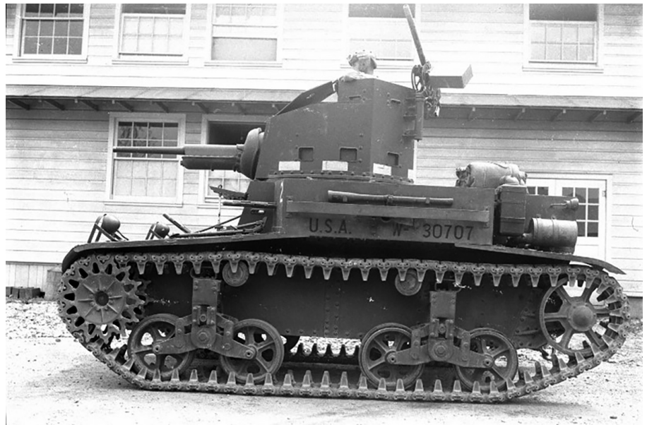
Figure 2. The M2A4 Light Tank with a turret-mounted 37mm gun.

reflected this bias in their training. The only common thread across the force lay in ensuring gunners understood the rudiments of how to fire and maintain their weapons.