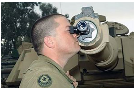
Figure 8. Using the in-bore muzzle boresight device.

Armor brigade combat teams, faced with compressed training timelines and recurring deployments found little time for traditional gunnery and combined arms maneuver. The frequency of gunnery fell from semi-annually to perhaps once or twice over a