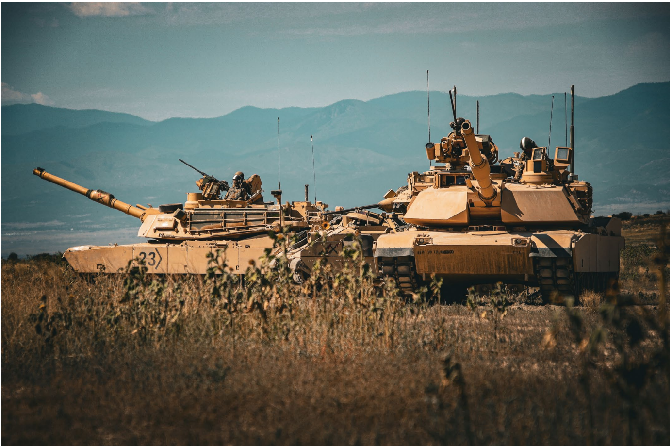
Figure 5: Elements from 2nd PLT, Company C, 1-8 Infantry and fire support assets prepare to displace to their next staging area.

Class III(P) should also be precisely monitored by platoons and the XO, so that needs are anticipated long-term in LOGSTATs to higher echelons. SOPs should require that M1 crews enter combat operations with at least three days of supply (3DOS) of Class III. LOGSTATs should anticipate requirements out to 72 hours of operations. 6 Loads and resupplies should interpret “3DOS” based on the unique requirements of the tanks. For instance, one of Crazy Horse’s tracks had a long-term issue which consumed turboshaft at higher-than-normal rates. As a result, that tank and the platoon carried more turboshaft compared to the rest of the company to meet the 3DOS standard. Crazy Horse found that 3DOS allowed the vehicles to