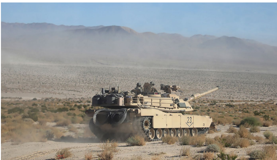
Figure 3: M1A2 crew from 3rd PLT, Company C, 1-8 Infantry moves to a secondary CP location during force-on-force operations as part of NTC Decisive Action Rotation 24-02.

While an armor company is OPCOM/OPCON to an ABCT headquarters, the reserve armor company should rely on its organic battalion for sustainment and support. This leverages long-term relationships; the battalion's FSC is likely practiced in