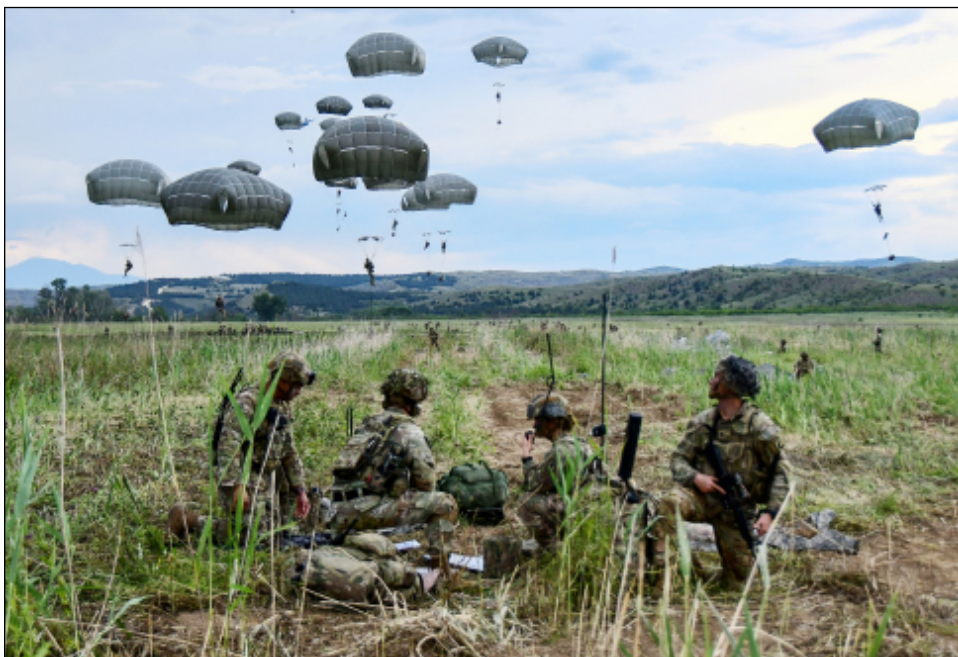
As a part of Swift Response 24, Soldiers in the 173rd Airborne Brigade conduct an airborne operation onto Krivolak Drop Zone in North Macedonia on 8 May 2024.

Airborne forces will mass combat power quickly; their speed and lethality will shock an opposing force.