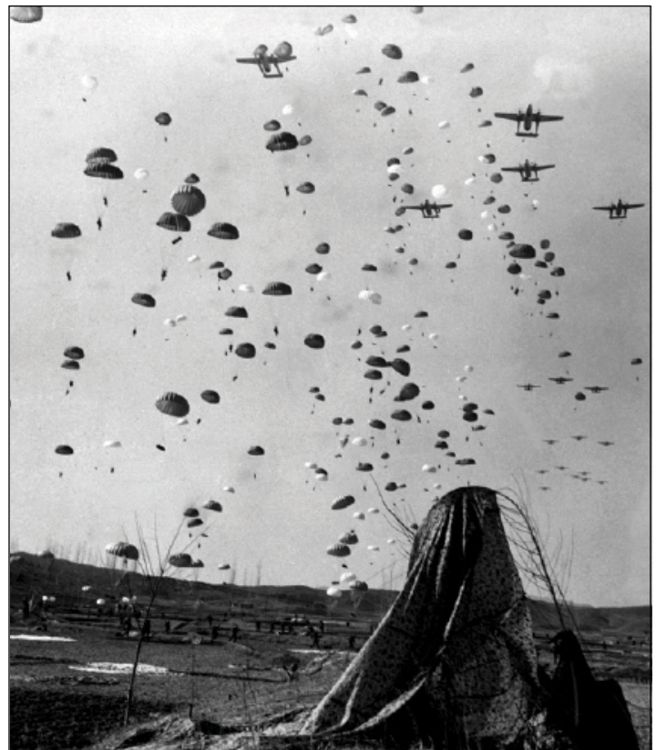
Paratroopers of the 187th Airborne Regimental Combat Team, 2nd and 4th Ranger Companies, and the Indian Army Parachute Field Ambulance unit jump into combat at Munsan-Ni, Korea, on 23 March 1951.

Airborne operations have occurred in every U.S. conflict since World War II. The lessons learned from Korea, Vietnam, Grenada, Panama, and GWOT provide a template for how commanders can execute airborne operations to succeed in LSCO. Airborne operations during World War II consisted of divisions of paratroopers (thousands of Soldiers) jumping to secure key terrain. Airborne operations during the Korean War were also large scale, using brigade-sized units to execute airborne operations. 18 In the Vietnam War, the military inserted battalions of paratroopers and squad-sized elements behind enemy lines during smaller airborne operations. On 25 October 1983, the 1st and 2nd Ranger Battalions conducted a parachute assault on Point Salines on the island of Grenada. Approximately 600 Rangers seized an airfield in the first American military use of troops since the Vietnam War. On 20 December 1989, the 82nd Airborne Division and the 75th Ranger Regiment executed parachute assaults in Panama to overthrow dictator Manuel Noriega's regime and restore civil order during Operation Just Cause. 19 These operations have one common trend: Each seized vital terrain.